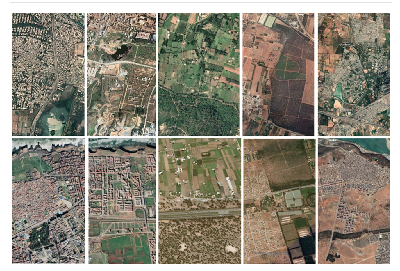
Fig. 2 Google Earth satellite images of the Bengaluru Metropolitan Area in southern India (above) and the Rabat-Kenitra Corridor in Morocco (below) demonstrating striking similarities in land use patterns across distant locations and cultural settings