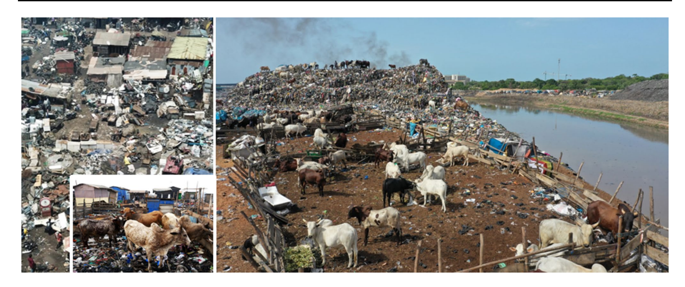
Fig. 5 The e-waste-recycling site of Agbobloshie in Accra, Ghana, just before its dismantling in July 2021 (left) and the neighbouring slum of Sodom to where rurban cattle fattening activities have shifted in April 2022 (right)