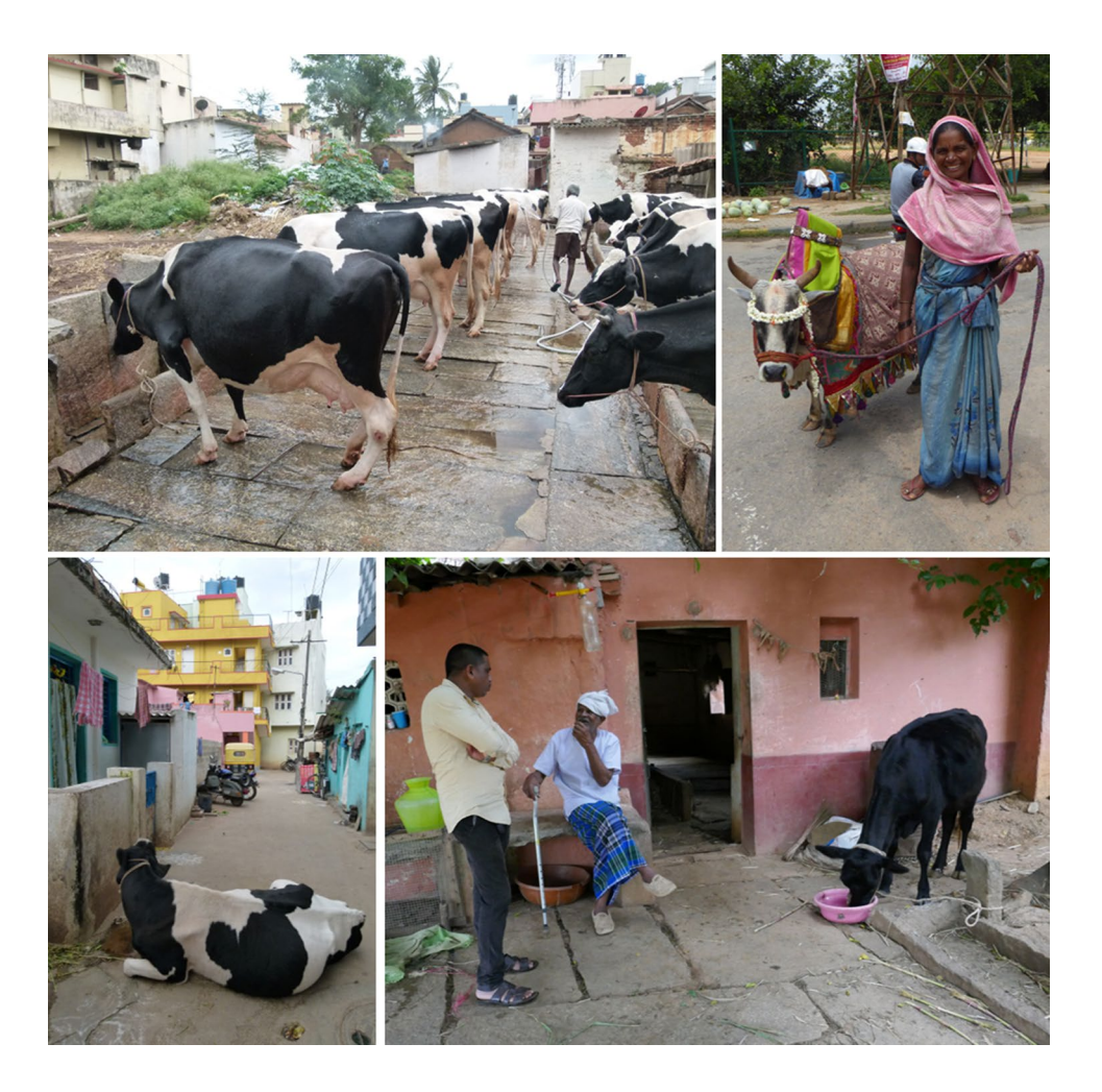
Fig. 4 Rurbanity exemplified by the close relationship between cows and humans in Bengaluru, India: dairy production in an inner-city animal shed (above left), a cow presented as cultural icon (above right), and dairy cows kept by households in different urban neighbourhoods (below)

Understanding this system as a rurban phenomenon allows us to analyse its features against the background of originally rural skills, traditions, and belief systems of the animal holders in an environment that has been quickly overgrown by the urban structure of a burgeoning megacity