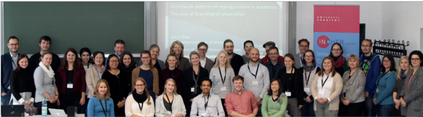
Organizers, participants and speakers at the 2017 summer school "Boundaries in Science and Higher Education"

Last year's "Summer School in Higher Education Research and Science Studies" was organized by INCHER-Kassel. It took place from the 9th - 13th October 2017 at the University of Kassel. Twenty-five graduates and 12 junior researchers took part in the Kassel summer school.