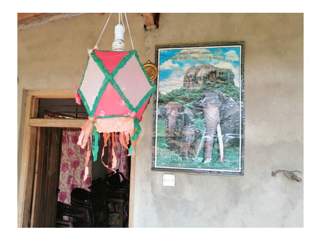
Fig. 4 Thunpath rena image in villagers' home. The Sinhalese text says: "We wish peace, prosperity and goodness for all."

According to interviews from villages, elephants are seen as "smart"—since they adapt their behavior in reaction to changing environments. Further, one