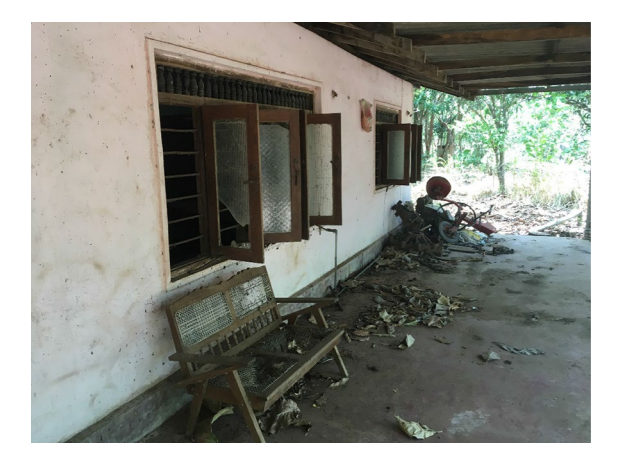
Fig. 3 Abandoned house, reportedly left by inhabitants due to HEC.

In addition to economic losses, there also appears to be a significant psychological burden connected to elephant encounters. Respondents said that they were afraid to travel or could not go out at all during nighttime. In three different locations, children were reportedly not sent to school in the morning for fear of elephant encounters. In Wahalkada, Anuradhapura District, a schoolgirl had been killed by an elephant when returning from school in the evening, according to an education official. Researchers have also been told that people, desperate because of HEC, had left