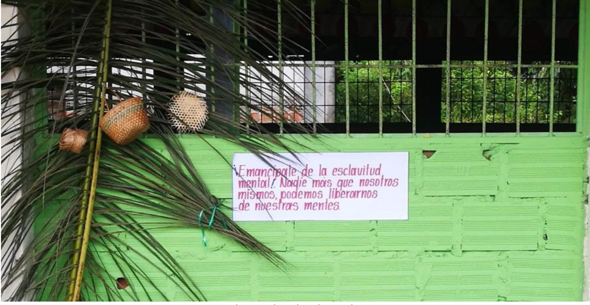
Figure 2 – Sign outside of the Assembly Hall in the Community Council of Yurumangui

Even though she admits that the decrease in subsistence agriculture also has to do with the regional rise of violence, inciting people to move closer together and to abandon their arable lands, she mainly sees 'modernity' as a driving force for this migration. To counteract these trends, leaders invest a lot of time and energy in building a cultural identity that ties community members to the territory. At Yurumangui's general assembly in January 2020 they emphasized repeatedly the importance of standing together in the fight against coca cultivation and industrial mining and repeated slogans such as "La tierra es la vida y la vida no se vende, se ama y se defiende" [The territory is life and life is not for sale, it is loved and defended) or "Alerta y camina, hasta la victoria siempre. Cómo? Luchando, quedando. Conciencia al pueblo" [Be alert and move, until victory always. How? By fighting, by staying. Conscience to the people]. Besides, identarian slogans decorated much of the village.