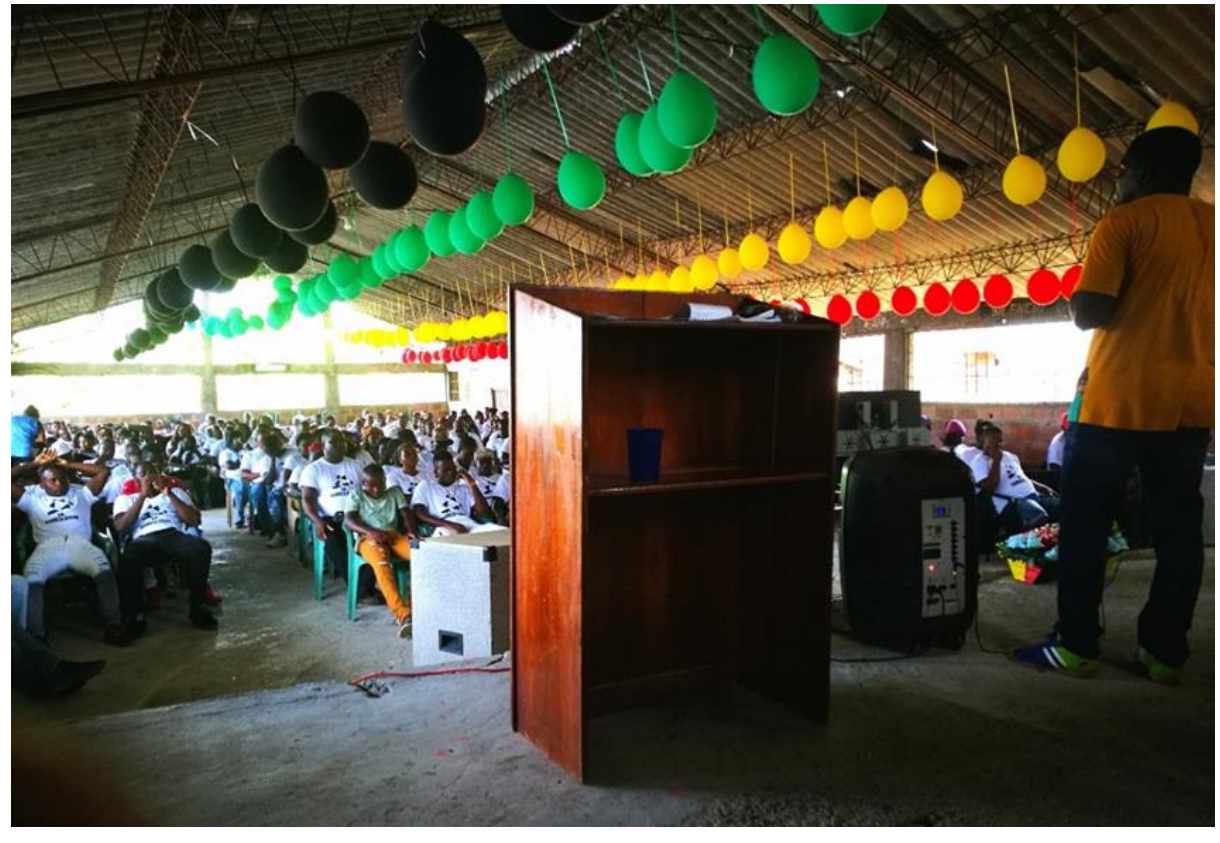
Figure 3 - General Assembly of the Community Council of Yurumangui