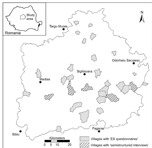
Fig. 1. Study region from Central Romania indicating the locations of the 30 focal villages and the villages where ecosystem service (ES) questionnaires were completed. Dots represent the major towns in the region.

Our study was conducted in the Saxon area of southern Transylvania (Fig. 1). Altitudes range from ~250 m to ~800 m above sea level. Land cover is dominated by meadows and pastures (~40% cover), deciduous forests (~30%), and arable land (~15%). Approximately 5% of the area is urban or industrial, and other land uses such as orchards and vineyards make up for the remainder. Rural communities are generally small: the average number of inhabitants in the 30 villages subjected to this research was 584 (range ~30-1900; Institutul National de Statistica 2011). Villages covered gradients in land covers, with different amounts of forest, arable land, and pasture cover, as well as ethnic composition, e.g., significant presence of Saxons, Romanians, Hungarians, and Roma, and activities by major local actors, such as nongovernment organizations.