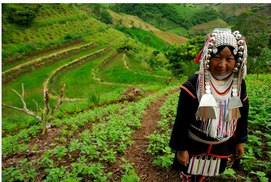
Figure 3. Ethnic Akha farmer amongst the varied agricultural landscape of Doi Mae Salong