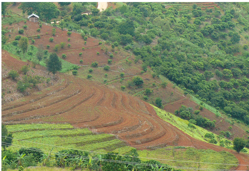
Figure 2. Terraced paddy fields and integrated agriculture plots with contour lines