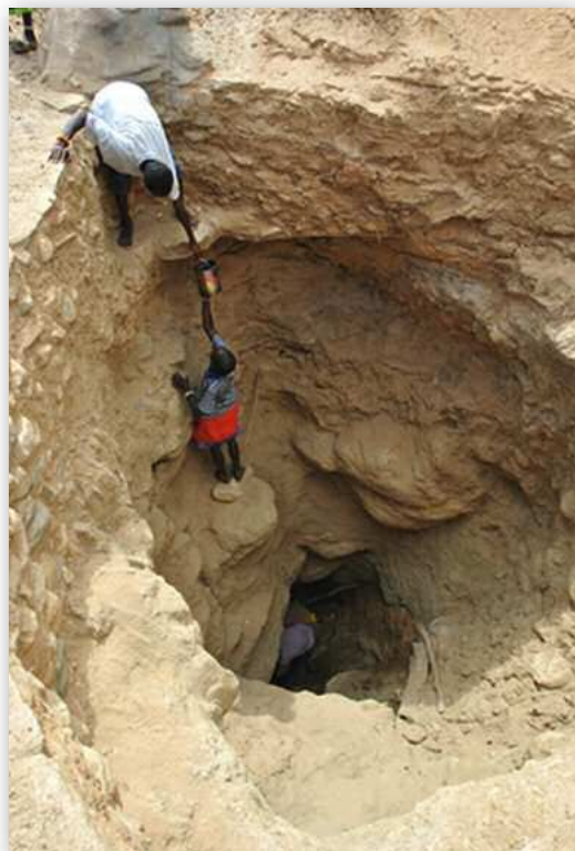
Watering in deep well