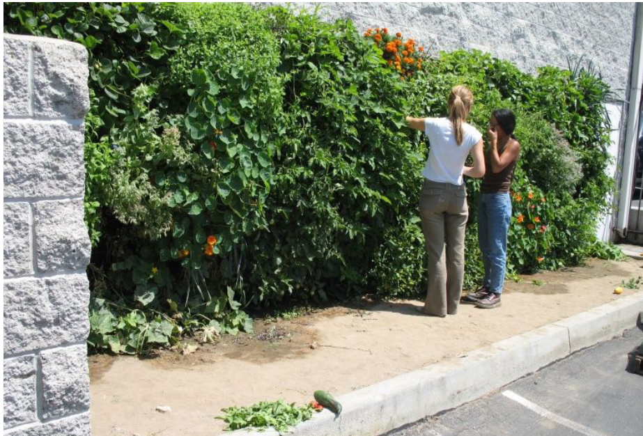
Figure 2: Food Chain, LA, USA, Edible Vertical wall (GR, 2008)

importance of soil-less systems to be set up with a resilient business plan to ensure the success of the system. If a household decides to set-up a soil-less growing system rather than a soil-based growing system, they will need to consider who will look after their plants when they are away from home (e.g. on holiday), as it would not be as simple as the neighbours coming to water the plants, although it could be simple if they arrange for a specialist company to look after their plants (Score 1 for resilience to neglect).