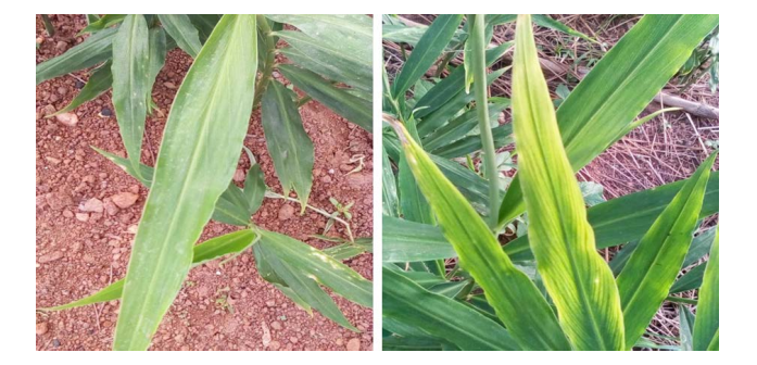
Fig. 1: Disease symptoms expression on ginger plants infected by WSMV: (A) healthy ginger leaf sample; (B) A typical WSMV disease symptom on young ginger leaves showing pale to yellow parallel interveinal streak and giving a mosaic pattern.

Data obtained on WSMV incidence were subjected to analysis of variance. Variation of means were considered significant at 5 % level of probability using either least significant difference (LSD) or by plotting standard error of means as described by Gomez & Gomez (1984).