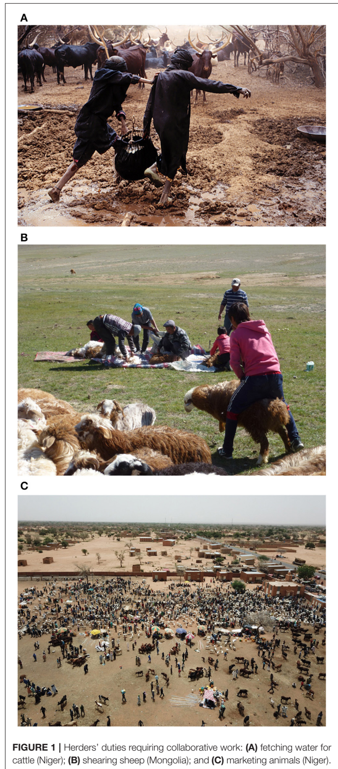
FIGURE 1 | Herders' duties requiring collaborative work: (A) fetching water for cattle (Niger); (B) shearing sheep (Mongolia); and (C) marketing animals (Niger).

For the individual or group responsible for the herd, the quantity and quality of available herding labor matters. Full herding requires following a herd for most of the day, depending on the quality of feed and the nutritional status of the livestock (Turner and Schlecht, 2019). Moreover, as outlined above, herding involves a range of activities beyond steering animals across a heterogeneously foddered landscape. Herders often perform veterinary care, scout new pasture areas, search for lost animals, transfer animals to other management herds and markets, and milk and water animals (Figure 1). In many dryland areas, watering animals involves the onerous task of drawing water from deep wells or digging temporary wells in dry wadi or depression areas. Moreover, the length of a grazing day increases as quality forage becomes more sparse. Herding is then more difficult and may require additional labor to navigate herds through areas of higher cultivation pressure or difficult terrain where livestock can get lost. Furthermore, herds on the move, distant from a home base, often require a minimum of two herders, so that when livestock are lost or stolen one herder can search while the other one stays with the herd (Turner and Hiernaux, 2008).