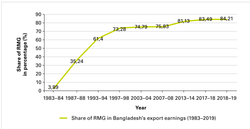
Figure 2: Share (%) of ready-made garments (RMG) in Bangladesh’s export earnings (1983–2019)

Integration with an open market-based economy, introduction of the Multifiber Arrangement in 1974 3 , an abundance of cheap labor force, and low governance altogether had worked as an impetus for the growth of the Bangladesh RMG sector (Belal and Roberts, 2010; Hossain et al., 2018; Raffaelli, 1994). According to the data published in March 2019 by the Export Promotion Bureau (EPB) and compiled by Bangladesh Garment Manufacturers and Exporters Association (BGMEA), the RMG sector made up approximately 84.27% of the country’s export earnings (more than 32 billion USD) between 2018 and 2019. This figure implies a substantial rise from 3.89% which the country was making in the year 1983–84 (Figure 2).