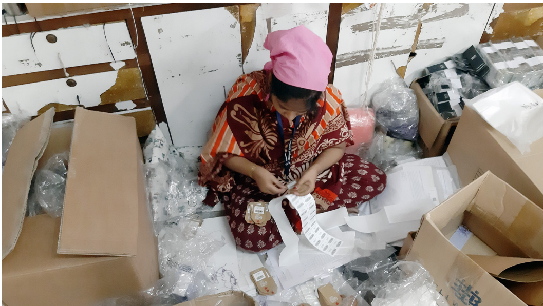
Figure 5: Female worker sticking labels in a RMG factory, Dhaka

Gender-based discrimination can be defined as any distinction, exclusion, or restriction based on one's gender which, as a result, hinders one's abilities to enjoy basic human rights and fundamental freedoms. In an industry where women constitute most of the workforce, gender-based discrimination presents a persistent feature that underlines all other social sustainability challenges faced by the workers. Manifestations of gender-based discrimination range from barriers to further career advancement, discrimination based on skill, marital status and age, to sexual harassment and gender-based violence (FWF, 2018; Nawaz, 2019).