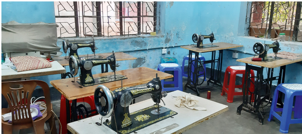
Figure 1: Sewing machines in a community house dedicated to rehabilitation of Rana Plaza survivors and their families. The picture was taken in Savar, Upazila District of Dhaka.

The garment 1 industry has become an important growth engine for the national economies in South and Southeast Asia. The last decades of the twentieth century marked a significant shift in garment production from Western Europe and North America to Asian developing countries like Bangladesh, China, Cambodia, Sri Lanka and Vietnam. With the rising costs of production in the former regions, the rationale governing the shift was that a labor-intensive sector needs access to abundant cheap labor to sustain profitability and ensure expansion. This was perceived favorably by the political and economic establishments within the emerging economies, since it provided them with an entry point into global supply chains (GSCs), bringing their industrialization efforts up to speed. In other words, access to GSCs enabled by multinational corporations lowered the entrance threshold to lucrative export markets for entrepreneurs from developing countries. Alas, the industry nowadays is characterized as highly competitive, whereby successful actors depend on the ability to respond quickly to changing customer needs and offer their products at a low price (Oelze, 2017). This provides an incentive to trade between garment retailers and low-cost suppliers in developing countries, who have, more often than not, paid little heed to the enforcement of social and environmental regulations so as to remain competitive.