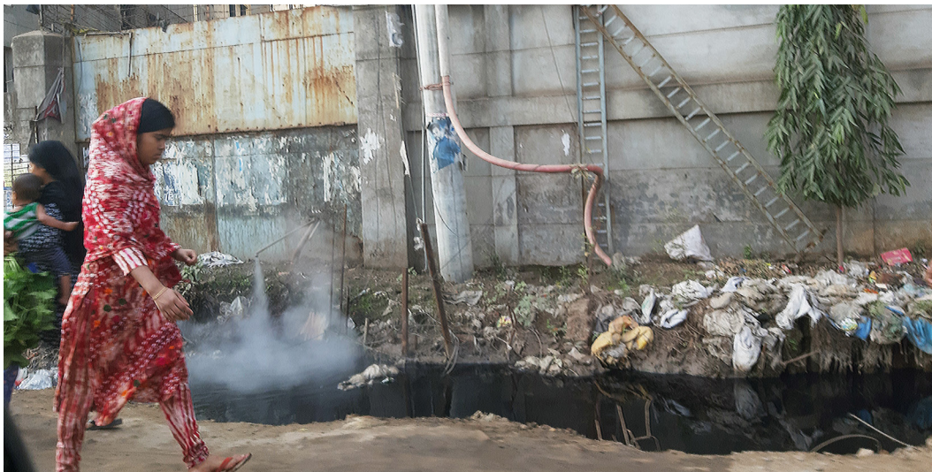
Figure 4: Road leading to the industrial zone Gazipur, Dhaka