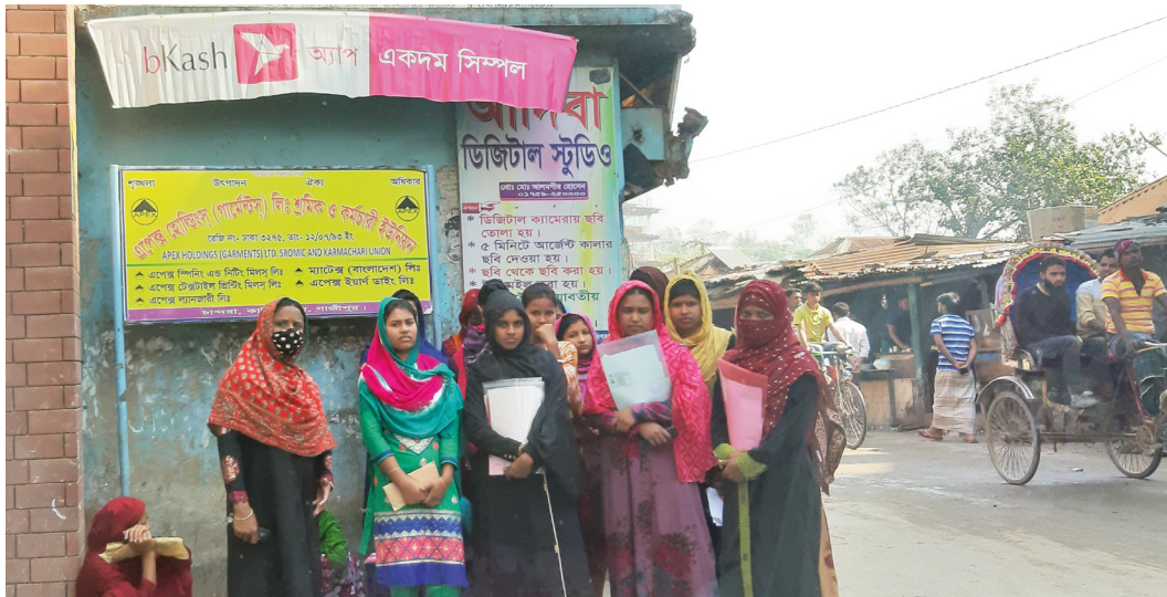
Figure 6: Young job seekers in front of a RMG factory in Gazipur, Dhaka

Unlike managerial and supervisory positions that are usually occupied by men, female employees working in low-skilled positions have been affected by the process of automation (Nawaz, 2019). Results of a study conducted by the Center for Policy Dialogue (CPD) demonstrate that the number of women as a percentage of the ready-made garments workforce declined from 64% in 2015 to 61% in 2016, due to job loss caused by automation (CPD, 2018). As one of the causes, Nawaz (2019) pinpoints to the patriarchal assumptions of employers and managers that disregard women as less capable of handling modern machinery than their male counterparts. As a result, women are less likely to receive training that would enable them to acquire skills necessary to fulfil the new requirements of the workplace and thus, they fall out of the workforce.