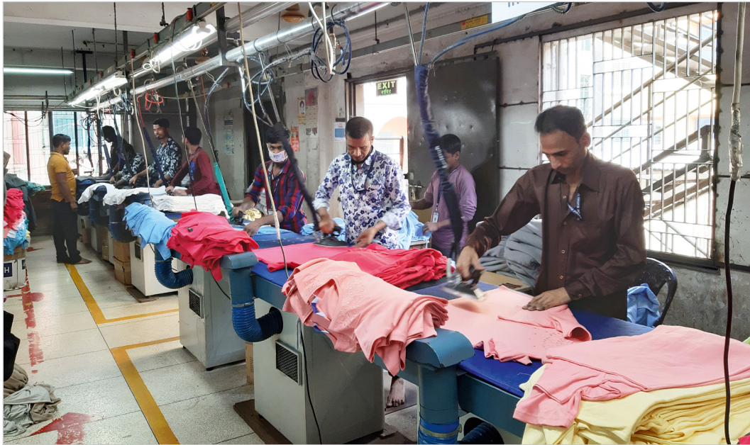
Figure 3: Male workers at the ironing department in a RMG factory, Dhaka

According to the Bangladesh labor force survey from 2016, the workforce in the Bangladesh RMG sector is young, with over 70 % of the workers (both male and female) being 29 years of age, or younger (Matsuura and Teng, 2020). Furthermore, it has been recorded that 60 % of the workforce has completed primary education, while 29,1 % of women and 17,9 % of men do not have any formal education (ibid.). What this demonstrates is that in an industry where educational levels are already low, a significantly larger share of the female workers is uneducated, when compared to their male counterparts.