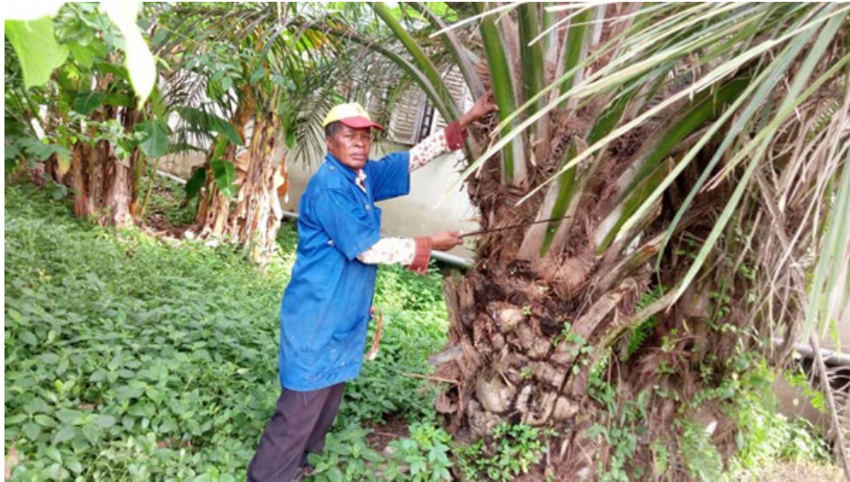
Figure 2: An urban farmer tends his backyard garden in Accra, Ghana

have in addition undermined the prospects of urban authorities to develop alternative consultation channels with residents on essential planning and policy issues. To address these shortcomings, there was an ongoing discussion for the city to allocate a large track of land near Lunyangwa agriculture research station for horticulture. In sum, key issues which deserve some attention in Malawi are the: (i) lack of proper official understanding of the actors involved in UA; (ii) true potential of urban farming in improving urban food security; (iii) financial challenges which hinders attempts to promote and regulate UA; (iv) lack of avenues for involving key stakeholders in the planning and decision making of the city; and (v) zoning codes proscribing UA.