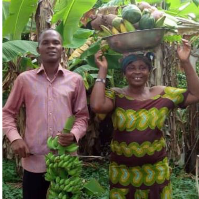
Figure 1: Urban farmers display the produce of their fruit and vegetable garden in the middle of Mzuzu, Malawi