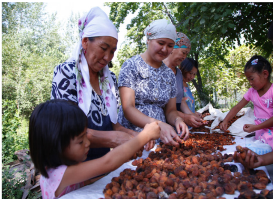
Women prepare fruits from solar dryer.

Kyrgyzstan is a mountainous and landlocked Central Asian country, one of five former Soviet Republics in the region. Agriculture is the main economic sector employing around 20% of population and contributing roughly 20% to the country's GDP. Due to its climatic conditions, the Central Asian region was considered as a space for growing cotton, wheat, fruits and vegetables and tobacco and other cultures during Soviet times. Owing to its nomadic culture, Kyrgyzstan has been active predominantly in the animal husbandry sector.