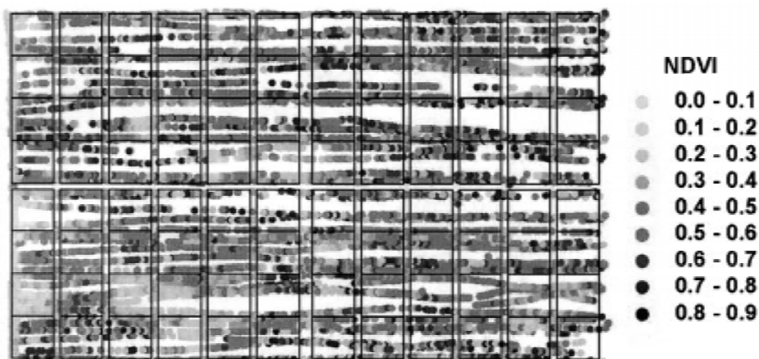
Figure 2. Punctual normalised difference vegetation index (NDVI) map obtained from radiometer measurements of the fallow vegetation on 24 August 1998.