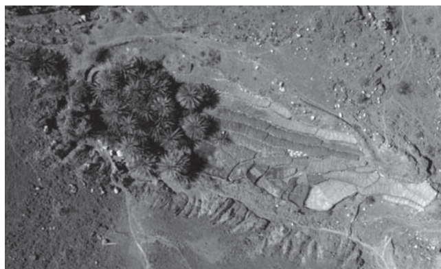
Plate 3. Aerial photograph of a typical mountain oasis with date palms and wheat fields.