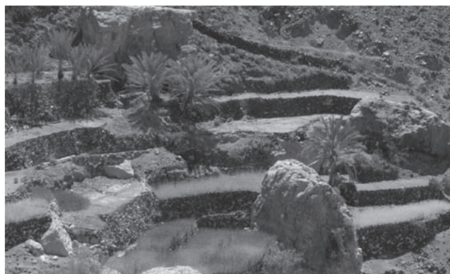
Plate 2. Typical small-scale agricultural setting with small wheat fields in northern Oman.