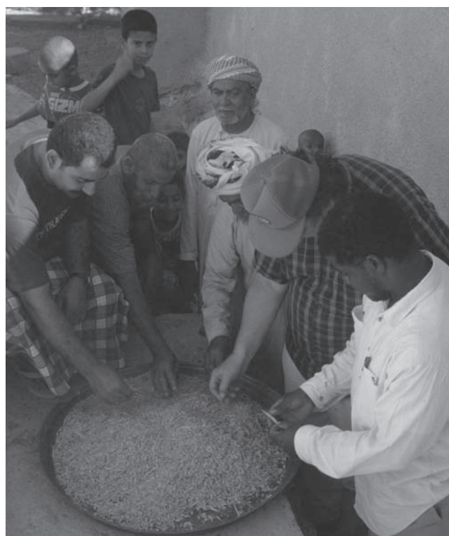
Plate 1. Researchers collecting seed in a small mountain village in Oman in March 2002.

The plot size cultivated to landraces by individual farmers in the typical oasis agriculture (Plates 2 and 3) was small, varying between 1 and 10 500 m 2 across the study zone. All wheat germplasm was sown broadcast as a sole crop, without chemical plant protection within the highly diverse mosaic of crops grown within the oases. Apparently rust diseases were the only agronomic problem hampering yields of landraces. The farmers interviewed during the survey stated that they preferred landraces to government-supported germplasm because of the tastiness of the grain, better adaptation of landraces to the land, lower susceptibility to rust and particularly because they also produced larger amounts of straw which could be fed to ruminants. All the farmers interviewed stated that they stored their grain at home on the head and would only thresh directly before its consumption by their family (Plate 4). Only a minor proportion of the grain was sold at