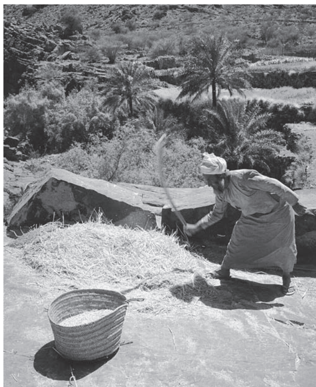
Plate 4. An Omani farmer manually threshing wheat.

harvest time to village visitors, or at the local market. A few times, ill-defined medicinal properties of landrace grain were mentioned as a major nutrition-related advantage of landrace grain over grain from 'modern' varieties. Seed exchange between farmers was reported to be frequent but at the same time, each farmer would do all he could to preserve the seed he had inherited from his father, or grandfather.