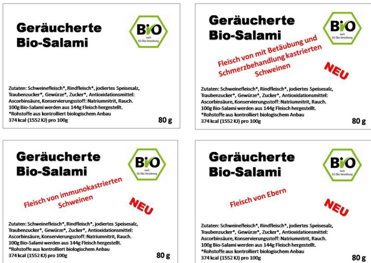
Figure 3: Labels on the packages of auctioned salami

Before the auction, the moderator explained the procedure of the auction and illustrated the optimal bidding strategy with an example (following Skiera & Revenstorff 1999). The prices mentioned in the example were in a completely different price range than normal prices for organic salami in order to avoid anchoring (Kaas & Ruprecht 2006). It was emphasized that the ‘winner’ of an auction must buy the product. The respective price would be set off against the allowance for participating in the study. Each person could only obtain one package of salami. If one participant placed the highest bid in several auctions, one auction would be determined as binding by drawing lots. Subsequently, the products were presented: four 80g packages of smoked organic salami. The only difference in the salamis was the method of piglet castration or, alternatively, non-castration: castration without pain relief, castration with anaesthesia and analgesia, immunocastration and fattening of boars (Figure 3). Participants placed their bids simultaneously on a prepared form for all four salami variants (see Appendix 5).