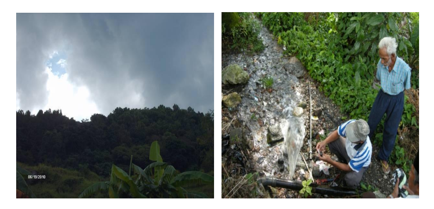
Figure 2: (a) Shadow of the rain area phenomena, (b) small creek to watering the farmland