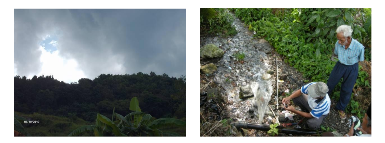
Figure 2 (a) Shadow of the rain area phenomena, (b) small creek to watering the farmland